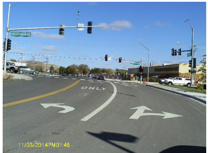
DEVELOPMENT SITE "A" LOOKING EAST