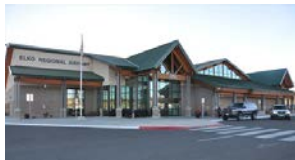
ELKO REGIONAL AIRPORT TERMINAL

Elko Regional Airport serves as the primary commercial service regional airport for Elko, Eureka, and White Pine Counties with some 20,000 passengers annually. The airport is also geographically situated in a transportation corridor that has access to I-80 Corridor, Union Pacific RailPort, Amtrak Transcontinental Zephyr Rail Line, Nevada State Highways 225 and U.S. 93. The Airport is situated next to a 20 acre geothermal development park and there is geothermal utility line on airport property for those seeking renewable heating capabilities.