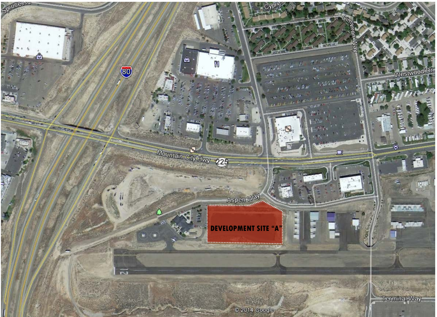
DEVELOPMENT SITE "A" LOOKING NORTH