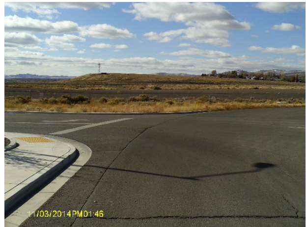
LEASE DEVELOPMENT SITE "A" LOOKING WEST