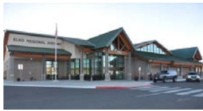
ELKO REGIONAL AIRPORT TERMINAL

Elko Regional Airport serves as the primary commercial service regional airport for Elko, Eureka, and White Pine Counties with some 20,000 passengers annually. The airport is also geographically situated in a transportation corridor that has access to I-80 Corridor, Union Pacific RailPort, Amtrak Transcontinental Zephyr Rail Line, Nevada State Highways 225 and U.S. 93. The Airport is situated next to a 20 acre geothermal development park and there is geothermal utility line on airport property for those seeking renewable heating capabilities.